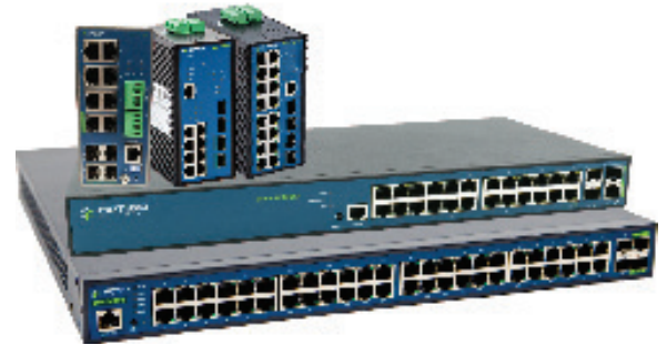
Optigo Connect Edge Switches

Industrial Optigo Connect edge switches bring the OT network right to the devices. These fanless switches can be DIN rail-mounted in a cabinet or panel alongside building automation, security, and IoT devices. Industrial Optigo Connect switches can share power supplies with other devices, and support redundant power supplies. The industrial nature of these switches means they are capable of withstanding more environmental variations than a rack-mounted switch.